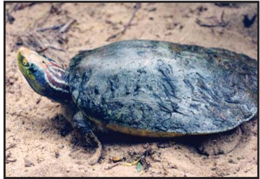
Red-crowned Roof Turtle