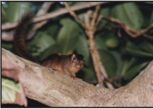
Nicobar Tree Shrew